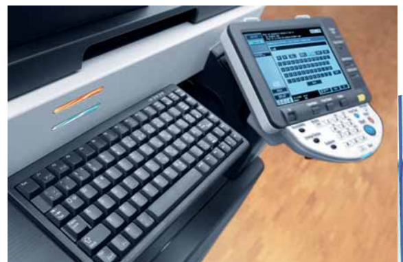
ineo 363 colour touchscreen display and the optional keyboard

A perfect team: Profit from the ineo 363 for all your monochrome printing and copying while the ineo+ colour systems guarantee professional colour output – a cost-efficient combination for high-quality office document production.