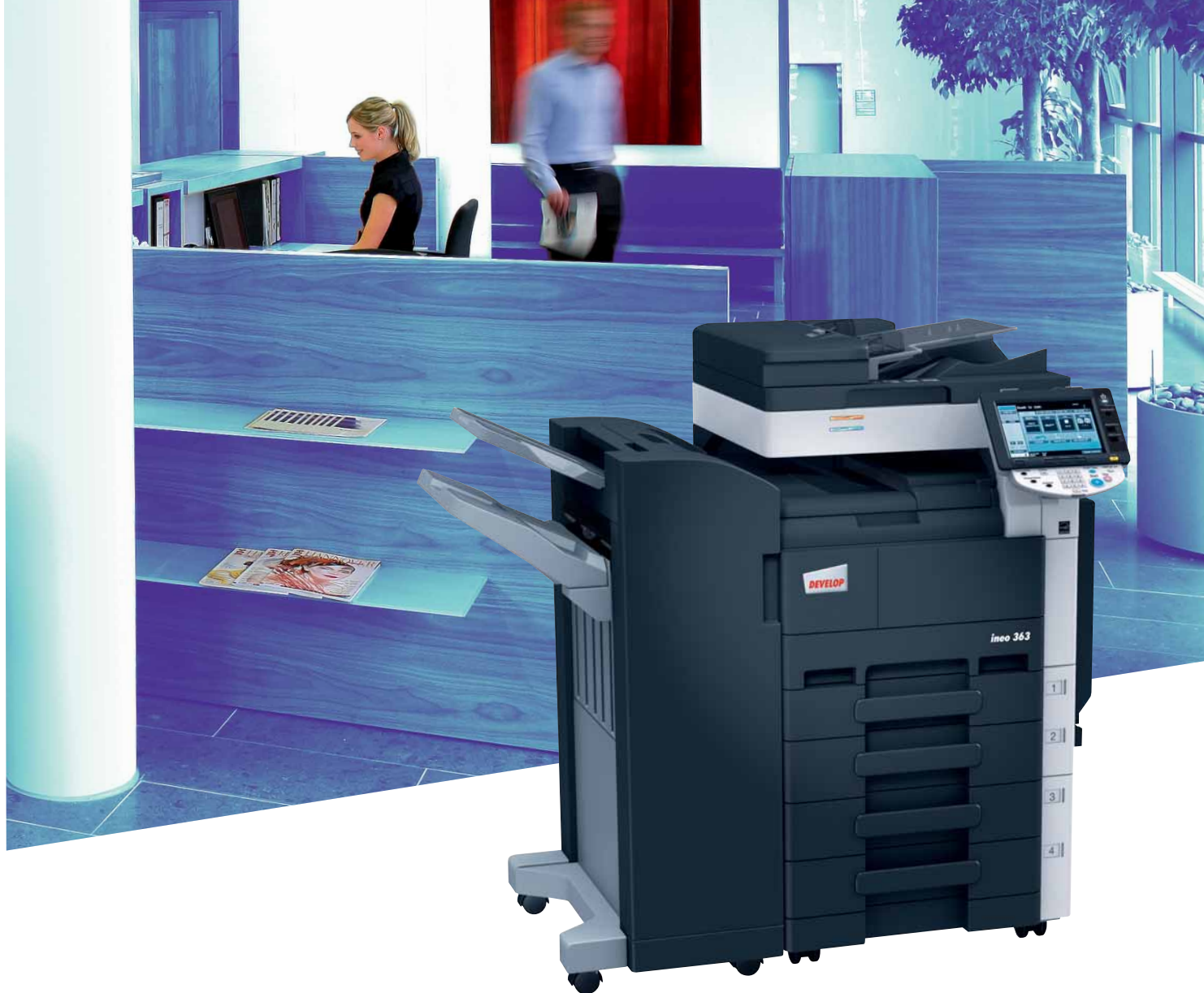
ineo 363 with floortype finisher (FS-527) and paper cassette (PC-208)