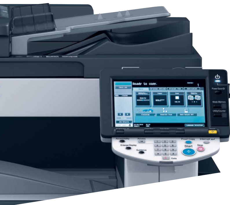
ineo 363's easy to use colour touchscreen display

The high print quality combined with a wide range of finishing functions allow professional office documents like brochures to be printed inhouse. Add to that the ability to punch and staple and office productivity will be enhanced even more.